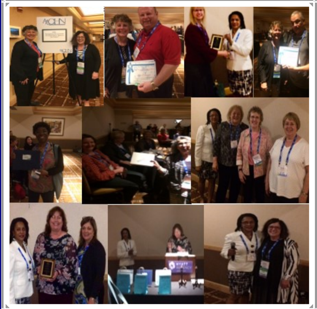
Memories from the ABOHN 2019 Reception!

Thank you to everyone who attended our Reception and Awards ceremony. Your support of ABOHN and your board certification not only keeps ABOHN strong, but helps to shine a spotlight on the unique role of the OHN in every industry that you touch.